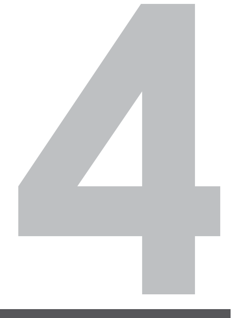
Port Jefferson Free Library