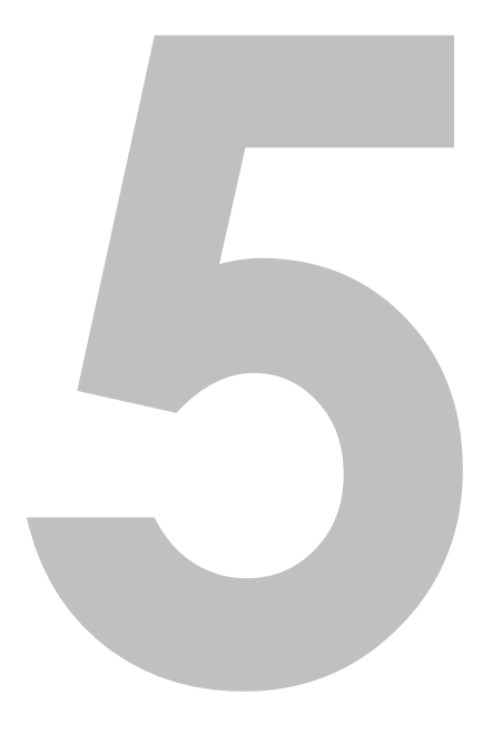
Port Jefferson Free Library