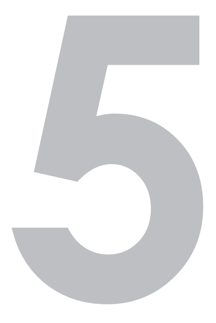
Port Jefferson Free Library